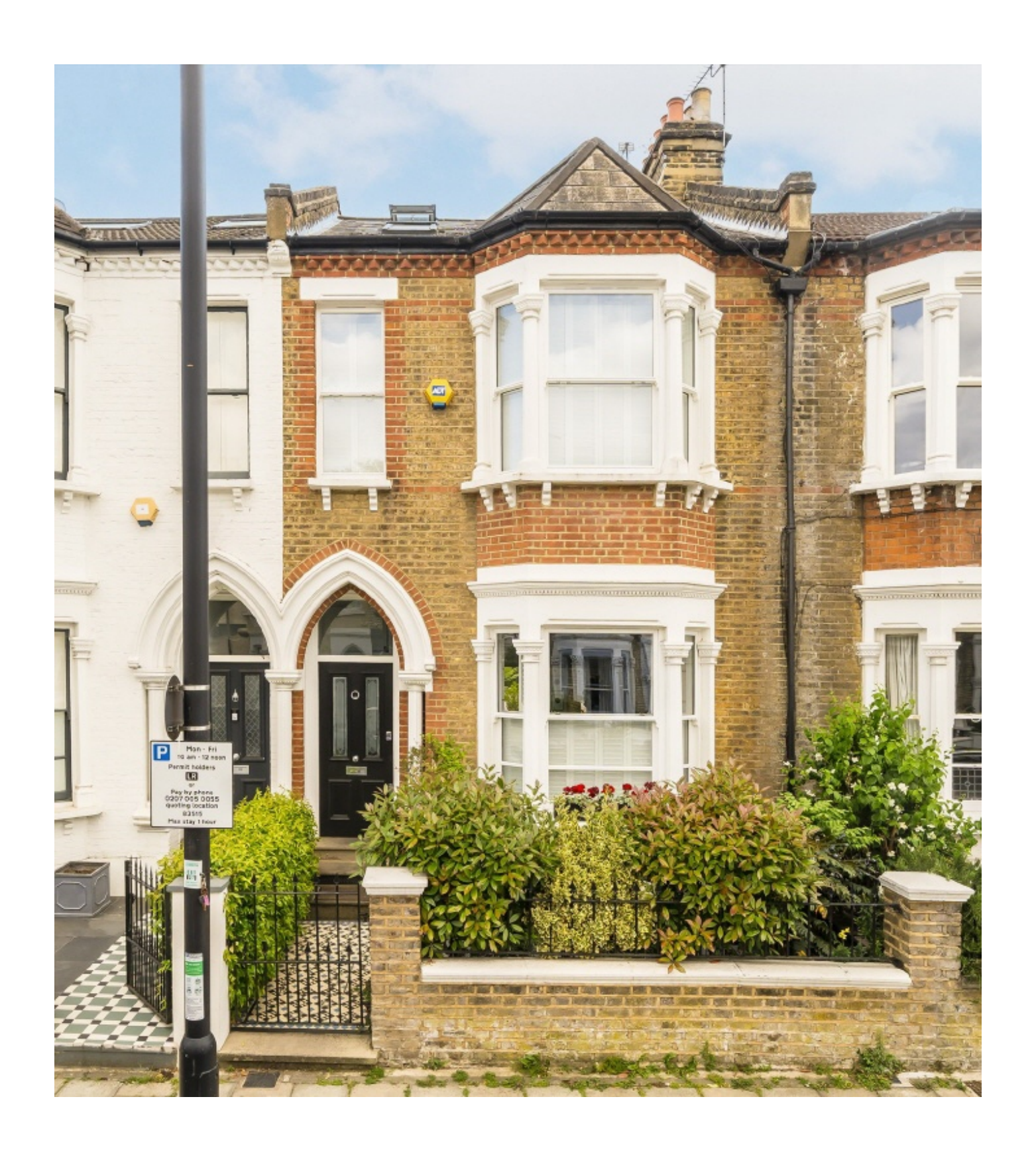
Abbeville Road, SW4 £2,100,000