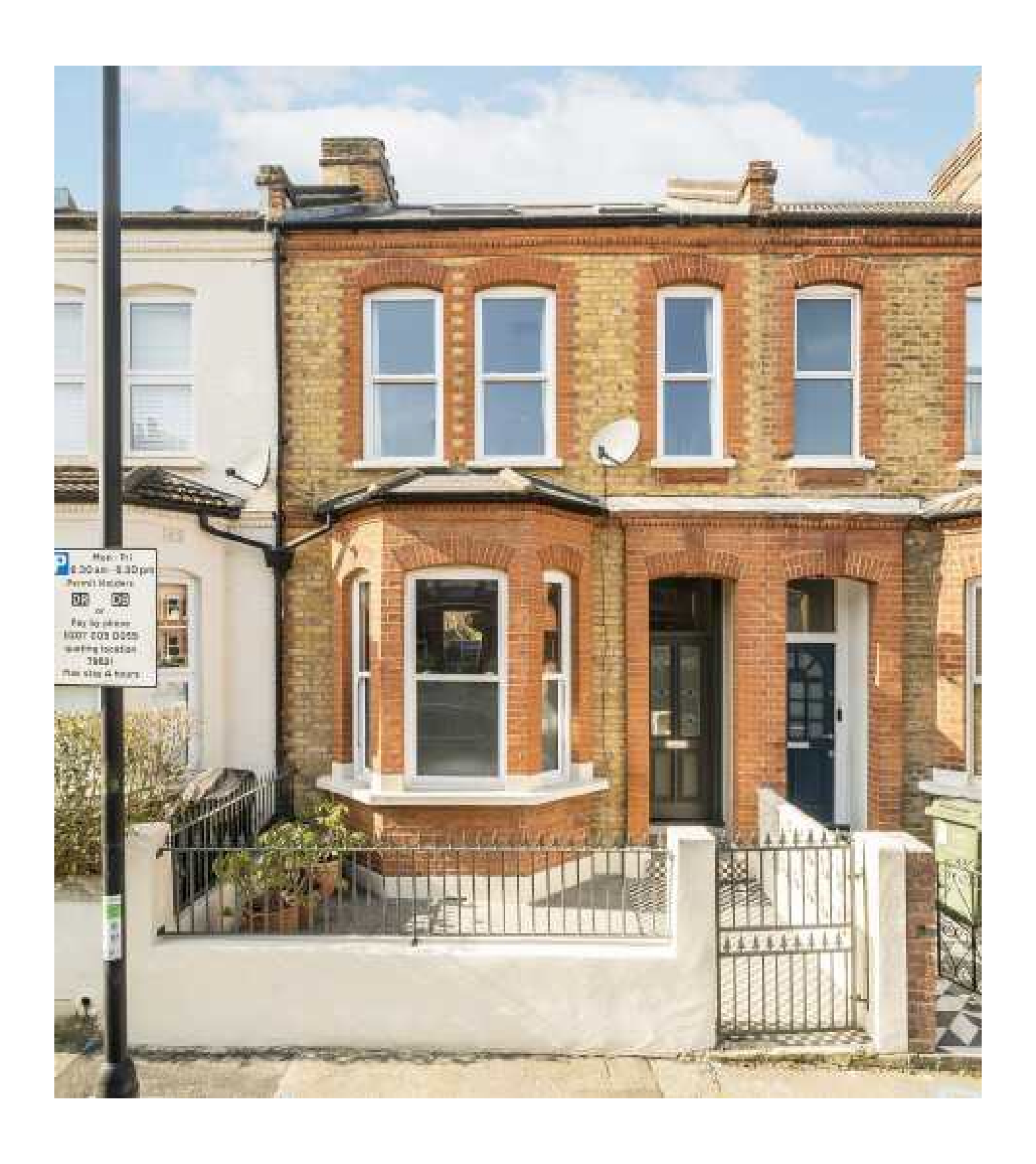
Kingswood Road, SW2 £1,165,000