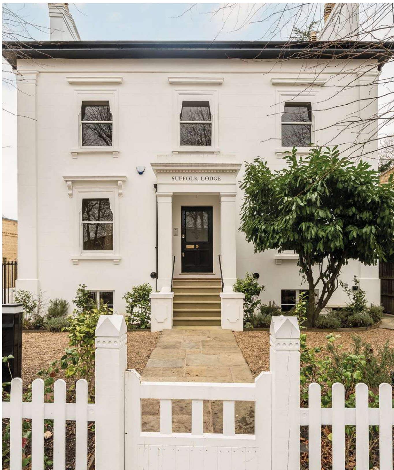
Park Hill Road Clapham