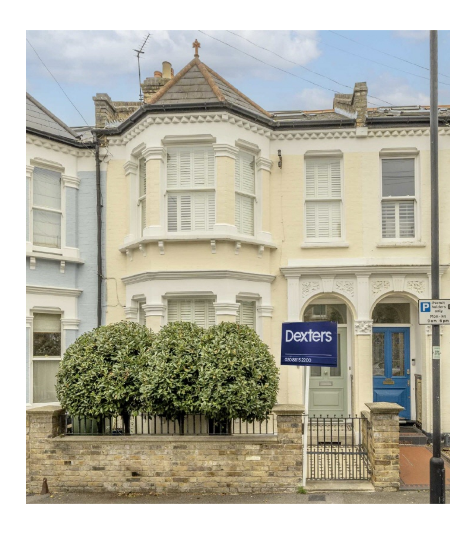
Narbonne Avenue, SW4 £1,699,950