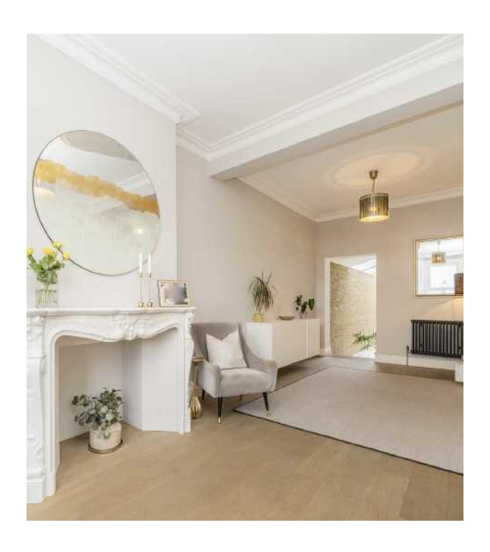
Rosebery Road, SW2 £1,300,000