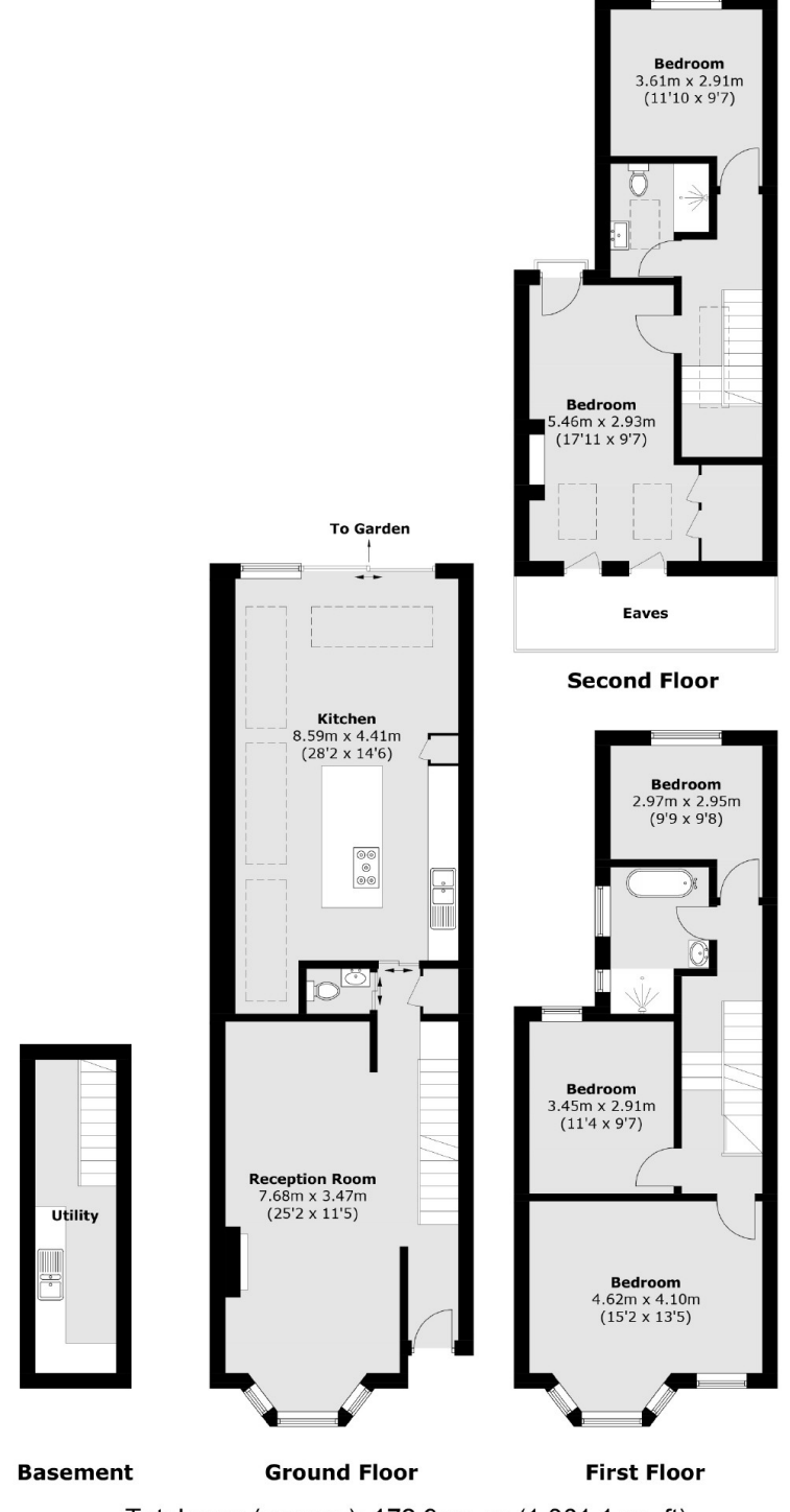
Total area (approx.): 172.9 sq. m (1,861.1 sq. ft) (Including Basement / Excluding Eaves)