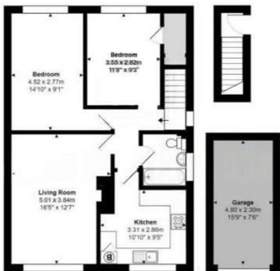
First Floor Flat

Warwick Gardens, Thames Ditton Total Area: 68.0 m 2 ... 732 ft 2 (excluding garage) FOR ILLUSTRATIVE PURPOSES ONLY.