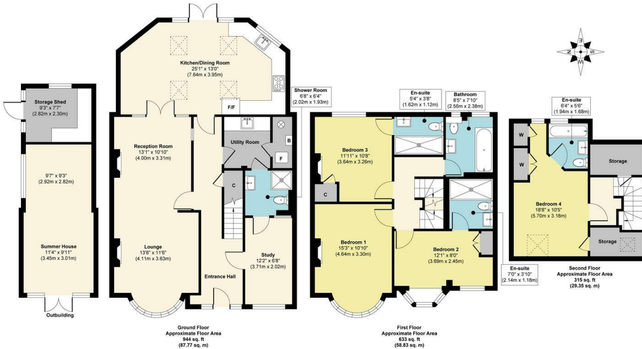
Approx. Gross Internal Floor Area 1892 sq. ft / 175.95 sq. m Illustration for identification purposes only, measurements are approximate, not to scale. Produced by Elements Property