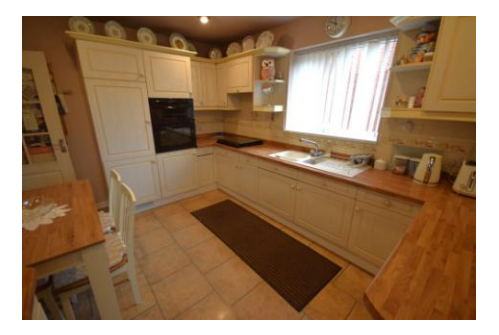
UTILITY ROOM 5' 5" x 9' 6" (1.65m x 2.9m)