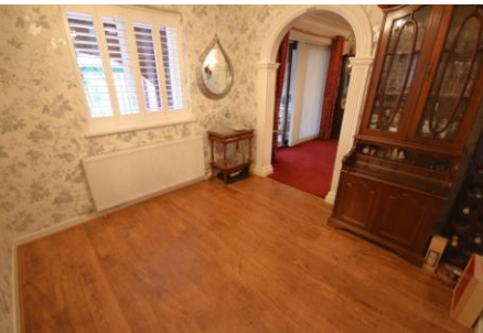
CONSERVATORY 20' x 13' 2" (6.1m x 4.01m)