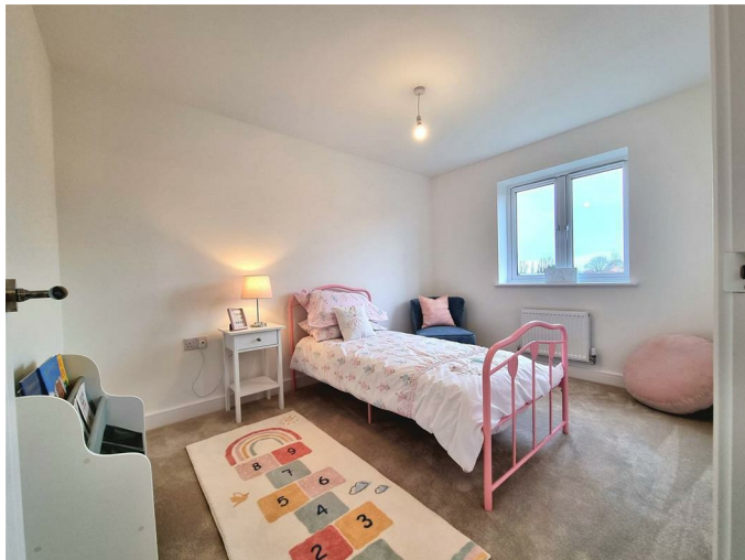
Bedroom Three 8'9" x 11'8" (2.69m x 3.58m)

Double Glazed Windows. White Emulsion to Ceilings and Walls. White Satin Skirting and doors. Chrome Door handles. Electric points. Television Point.