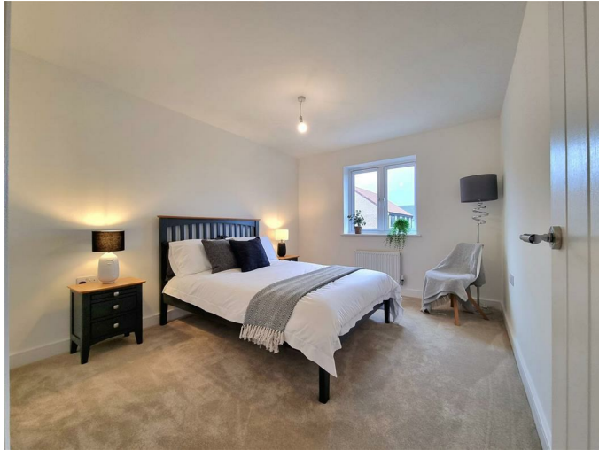
Bedroom Two 10'0" x 12'5" (3.07m x 3.81m)

Double Glazed Windows. White Emulsion to Ceilings and Walls. White Satin Skirting and doors. Chrome Door handles. Electric points. Television Point.