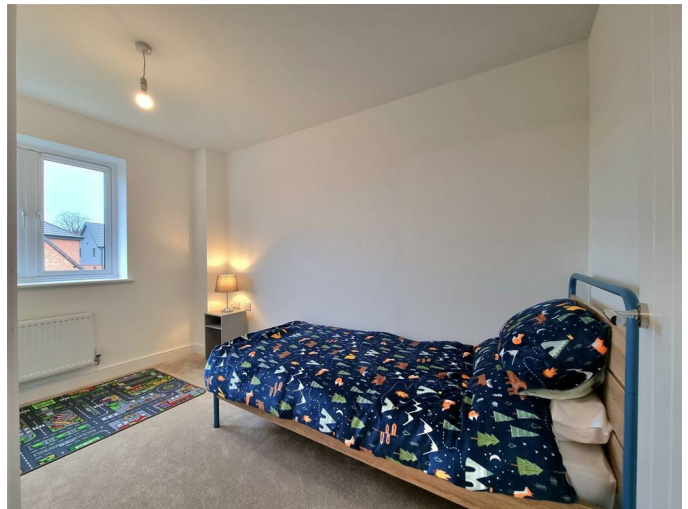
Bedroom Four 8'10" (max) m x 11'8" (2.71 (max) m x 3.58m)

Double Glazed Windows. White Emulsion to Ceilings and Walls. White Satin Skirting and doors. Chrome Door handles. Electric points. Television Point.