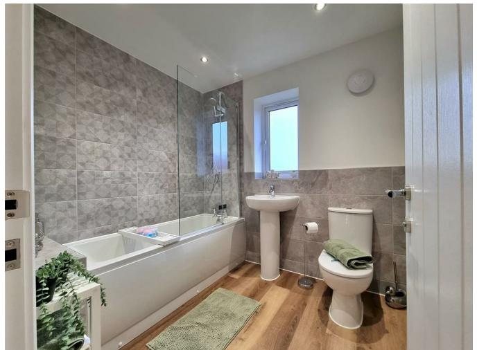
Bathroom 7'8" x 6'9" (2.35m x 2.06m)

Fitted White Sanitaryware. Extractor Fan. Shaver Point. Chrome Heated Towel Rail. Tiling around bath. LVT Flooring.