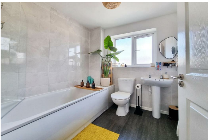
PVCu double glazed window to front, skimmed ceiling, LVT flooring, chrome wall mounted heated

towel rail, wall tiling. Fitted with a three piece suite comprising panel bath with chrome mixer tap over and thermostatic bar shower, close coupled toilet with push button flush and pedestal wash hand basin with chrome taps over.