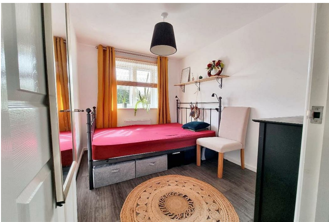
PVCu double glazed window to rear, skimmed ceiling, radiator.