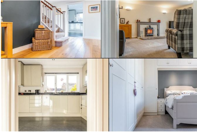
First Floor Landing 16'0" x 6'1" (4.89 x 1.87)