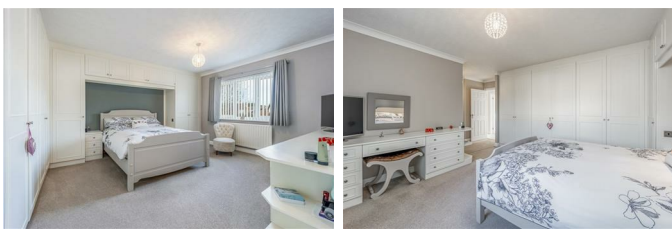
PVCu double glazed window to front. Coving to textured ceiling. Radiator. Fitted with a range of fitted furniture including full height wardrobes, bedside tables, drawers and dressing table. Opening to dressing area 1.28m x 3.10m with fitted full height wardrobe. Door to: