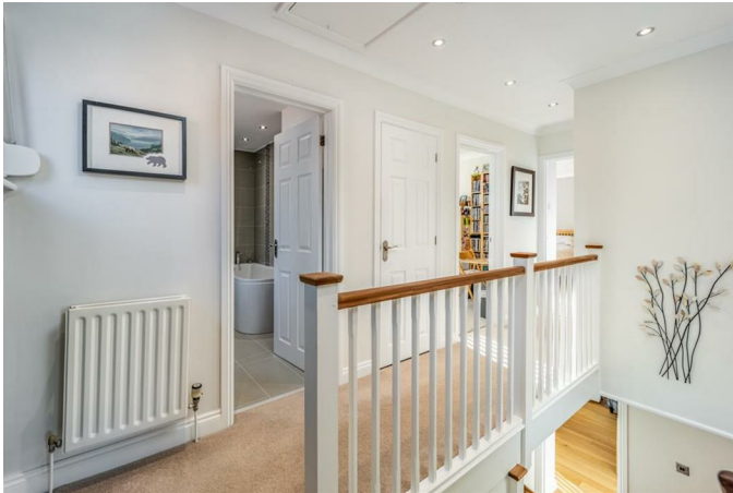
Coving to skimmed ceiling with recessed ceiling spotlights. Radiator. Loft access. Doors to bedrooms and bathroom.