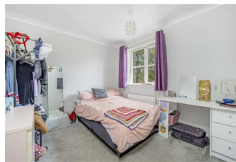
Bedroom Two 10'2" x 8'9" (3.12m x 2.68m)

Wooden double glazed window to rear. Coving to textured ceiling. Radiator.