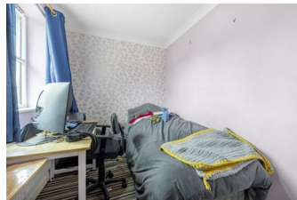
Bedroom Four 10'4" x 6'5" (3.17m x 1.96m)

Wooden double glazed window to side. Coving to textured ceiling. Radiator.