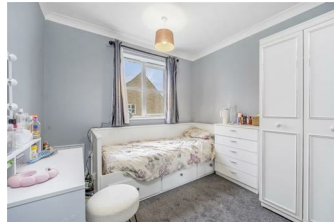
Bedroom Three 10'5" x 6'9" (3.20 x 2.06)

Wooden double glazed window to rear. Coving to textured ceiling. Radiator.