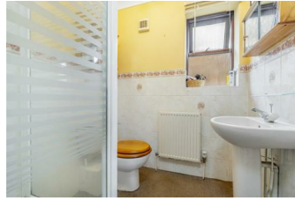
En-Suite 5'2" x 5'6" (1.60m x 1.69m)

Wooden double glazed window to rear. Coving to textured ceiling. Extractor fan. Radiator. Glazed shower cubicle with mains shower. Close coupled toilet and pedestal wash hand basin with mixer tap over.