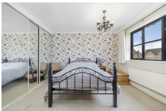
Bedroom One 15'8" x 11'3" (4.78m x 3.45m)

Wooden double glazed window to front. Coving to textured ceiling. Radiator. Full height built in wardrobes with mirrored sliding doors. Door to ensuite.