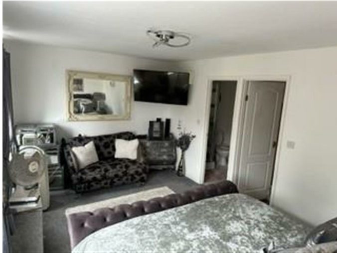
Bedroom 16'10" x 10'3" (5.15m x 3.13m)

PVCu double glazed windows to front, twin radiators, door to ensuite.