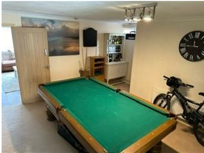
Door to office and door to inner hall.