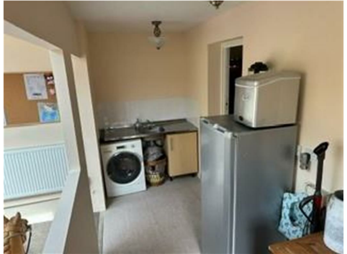
Opening to garden room, utility space with space and plumbing for washing machine, worktop space over.