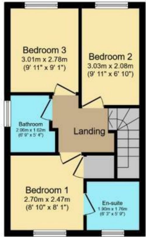
First Floor Floor area 37.1 m 2 (399 sq.ft.)