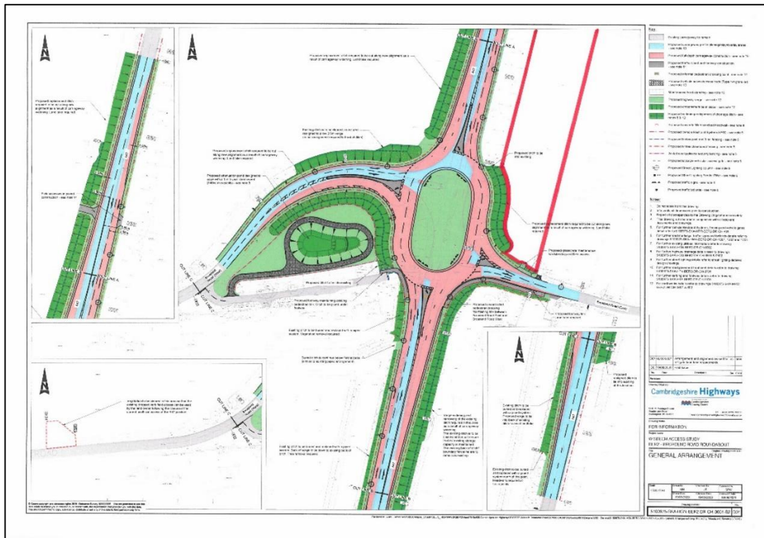
For Identification Purposes Only Not to Scale