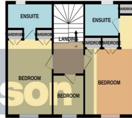
1ST FLOOR 555 sq.ft. (51.6 sq.m.) approx.