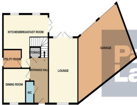
GROUND FLOOR 1047 sq.ft. (97.2 sq.m.) approx.