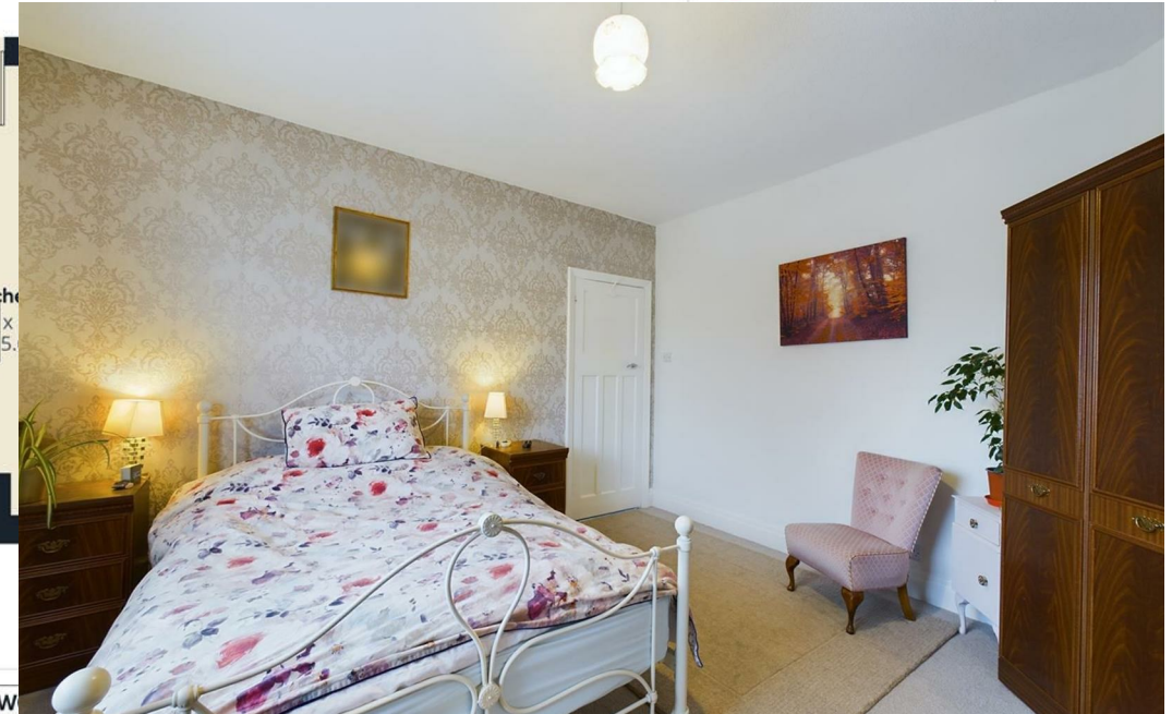
3'2" x 4'2"