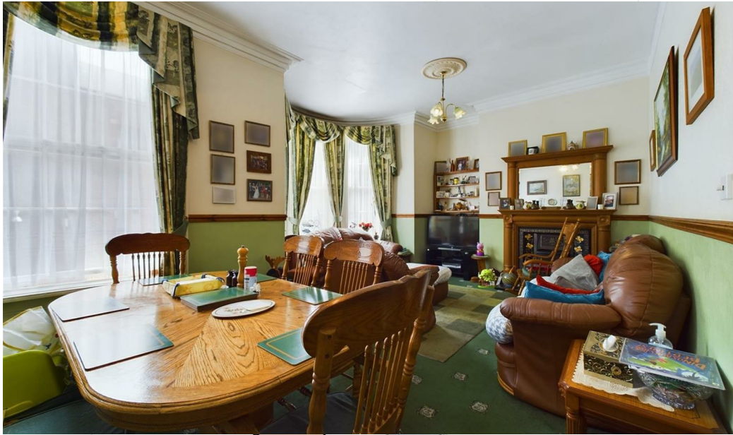
Living Room 11'0" x 12'0" 2.74 x 3.66 m