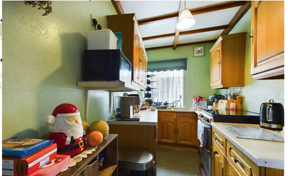
Kitchen 10'0" x 10'0" 3.05 x 3.05 m