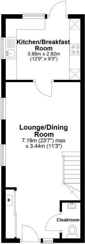
Ground Floor Approx. 34.5 sq. metres (370.9 sq. feet)