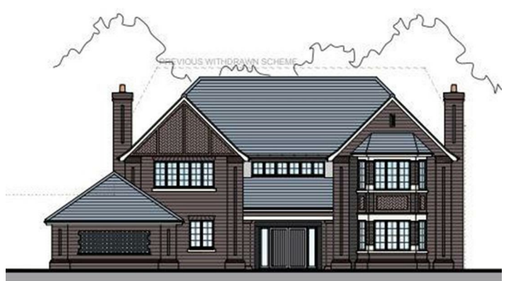
FRONT ELEVATION (1:100)