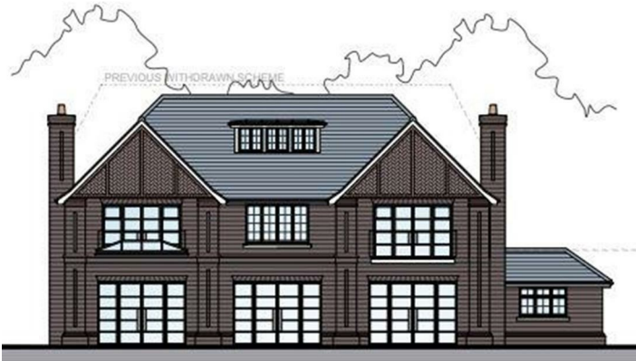
REAR ELEVATION (1:100)