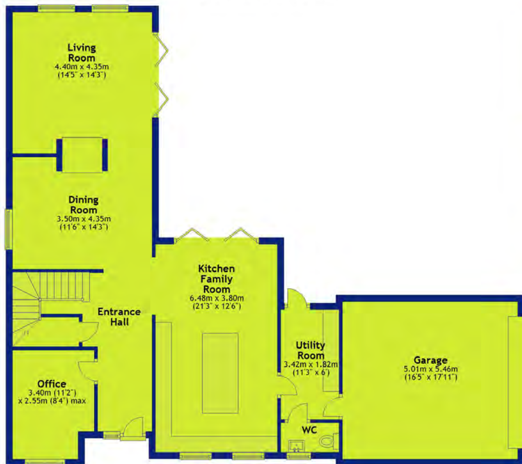
Ground Floor Approx. 120.1 sq. metres (1292.2 sq. feet)