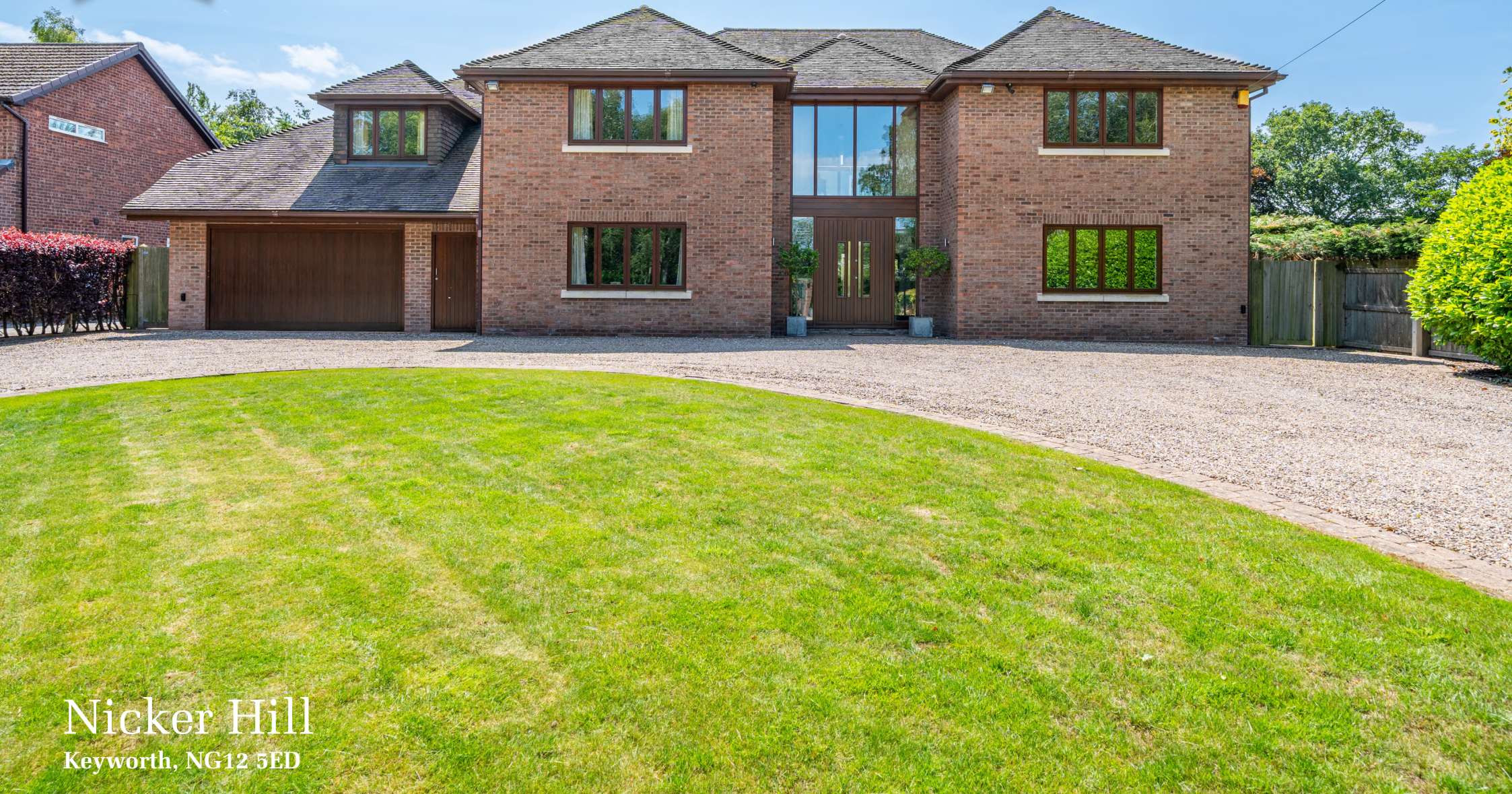
Nicker Hill Keyworth, NG12 5ED