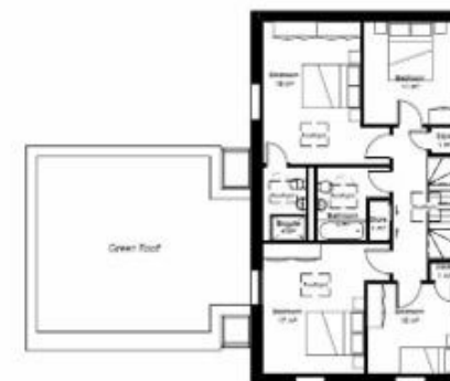
2 Second Floor GA Plan 1:100