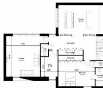
1 Floor Floor GA Plan 1:100