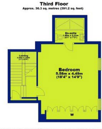
Total area: approx. 173.4 sq. metres (1866.9 sq. feet)