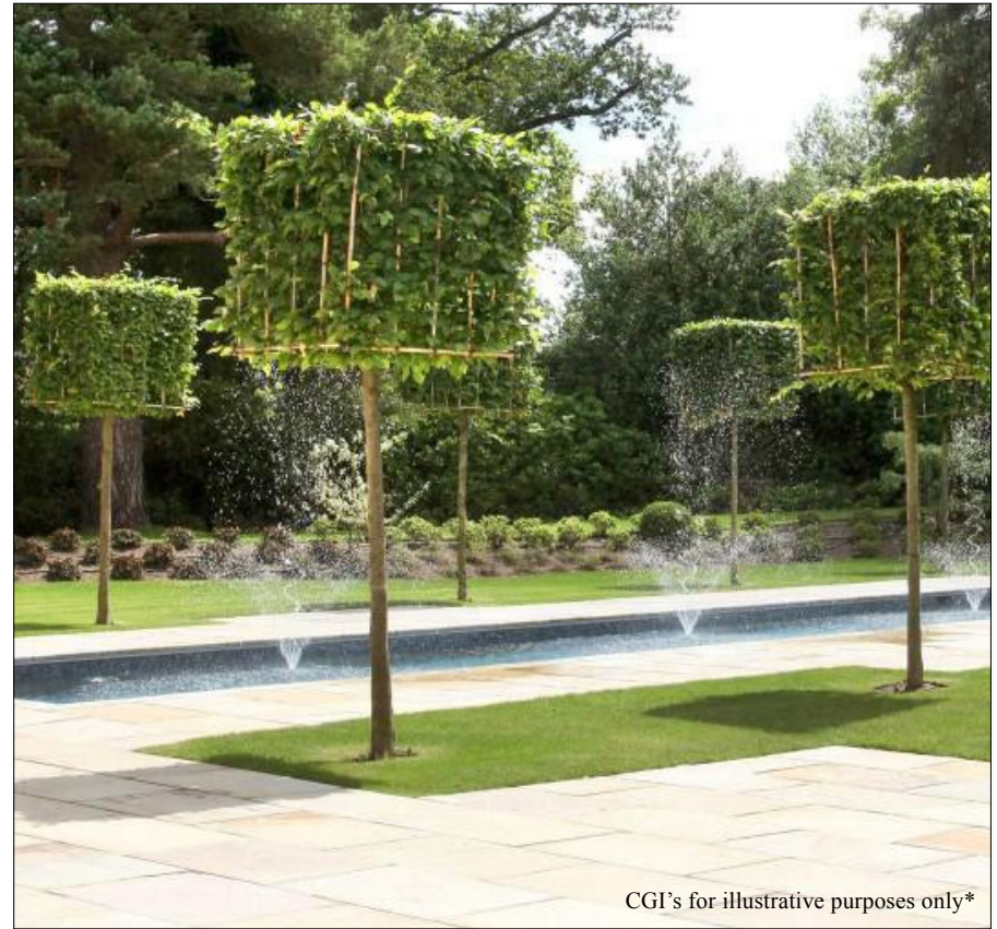
CGI's for illustrative purposes only*

Edwalton benefits from its proximity to all that West Bridgford has to offer, whilst providing quick and easy access to Leicester via the A46 and the A1 and M1.