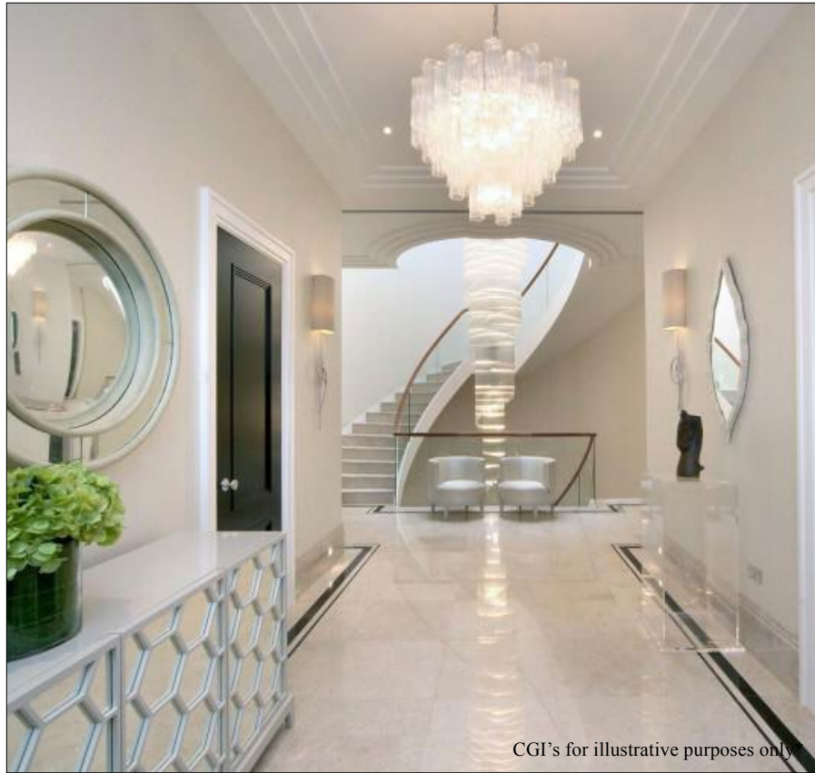
CGI's for illustrative purposes only