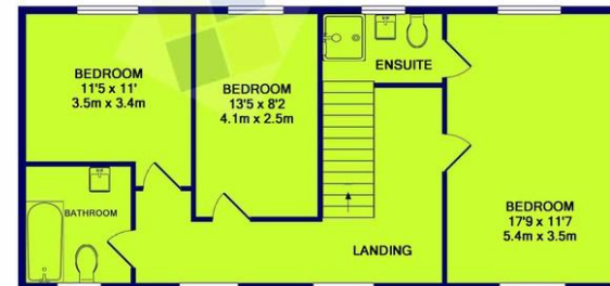
2ND FLOOR APPROX. FLOOR AREA 688 SQ.FT. (63.9 SQ.M.) TOTAL APPROX. FLOOR AREA 2065 SQ.FT. (191.8 SQ.M.)