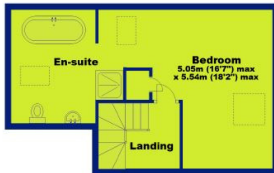
Second Floor Approx. 38.0 sq. metres (408.5 sq. feet)