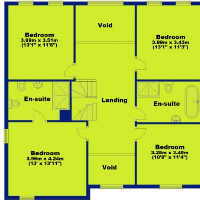
First Floor Approx. 102.3 sq. metres (1101.1 sq. feet)