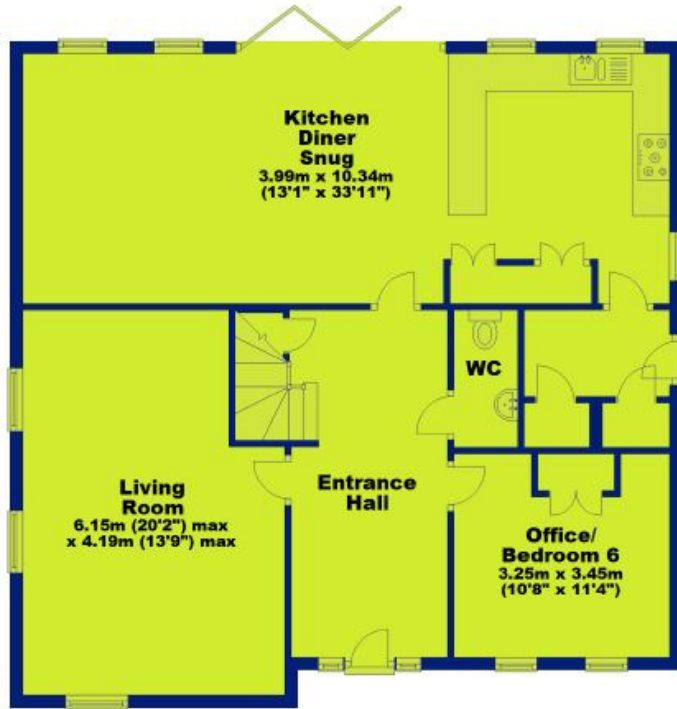
Ground Floor Approx. 102.1 sq. metres (1098.8 sq. feet)