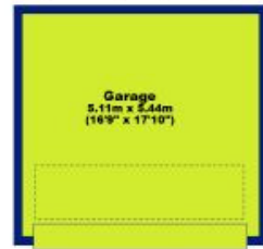
Garage Approx. 27.8 sq. metres (299.8 sq. feet)