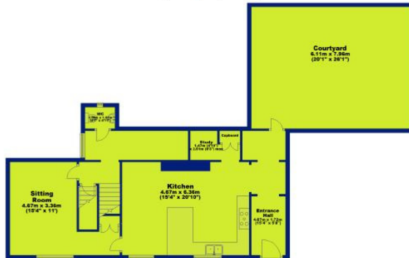
Ground Floor Approx. 130.7 sq. metres (1407.2 sq. feet)