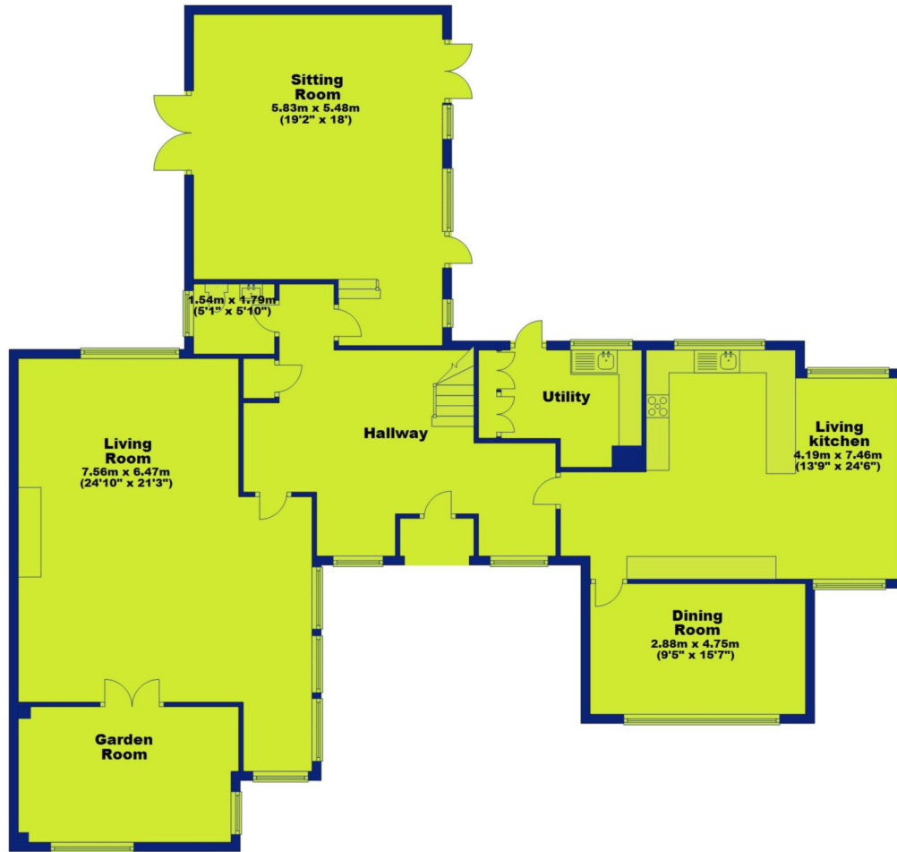
Ground Floor Approx. 181.9 sq. metres (1957.8 sq. feet)