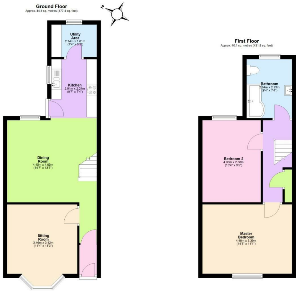
Total area: approx. 84.5 sq. metres (909.2 sq. feet) 27 Upper Street , Totterdown, Bristol