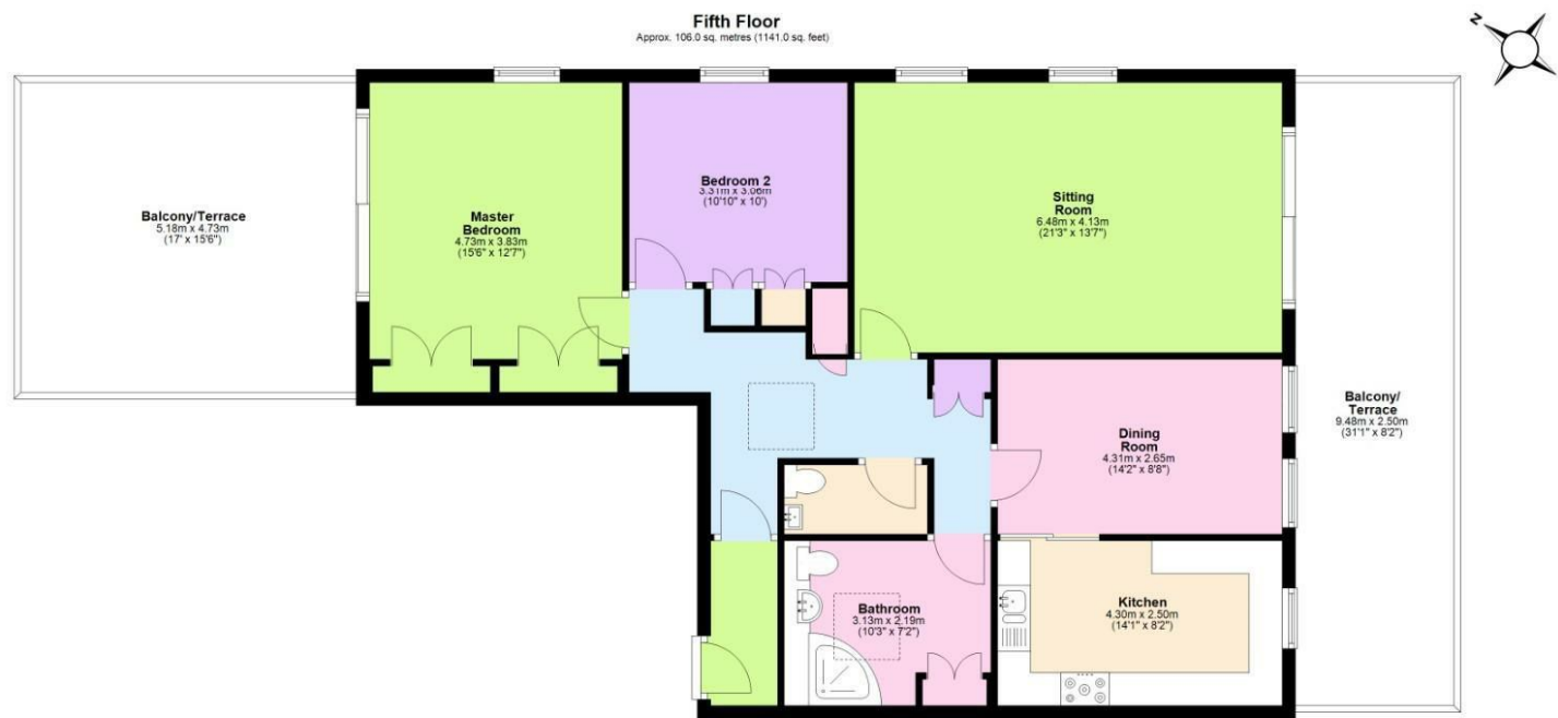
Total area: approx. 106.0 sq. metres (1141.0 sq. feet) 35 St Kenya Court, Keynsham