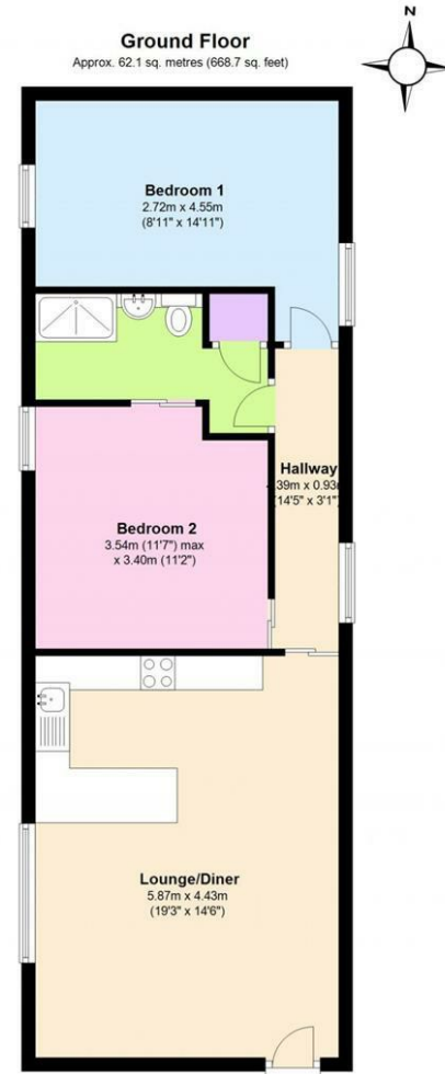
Total area: approx. 62.1 sq. metres (668.7 sq. feet) Flat 1 The Barn , 59 Wellsway , Keynsham, Bristol