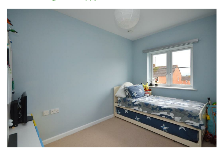
UPVC double glazed window to front aspect, double radiator