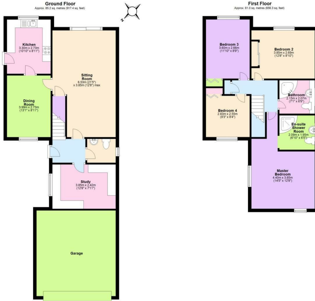
Total area: approx. 146.2 sq. metres (1573.7 sq. feet)