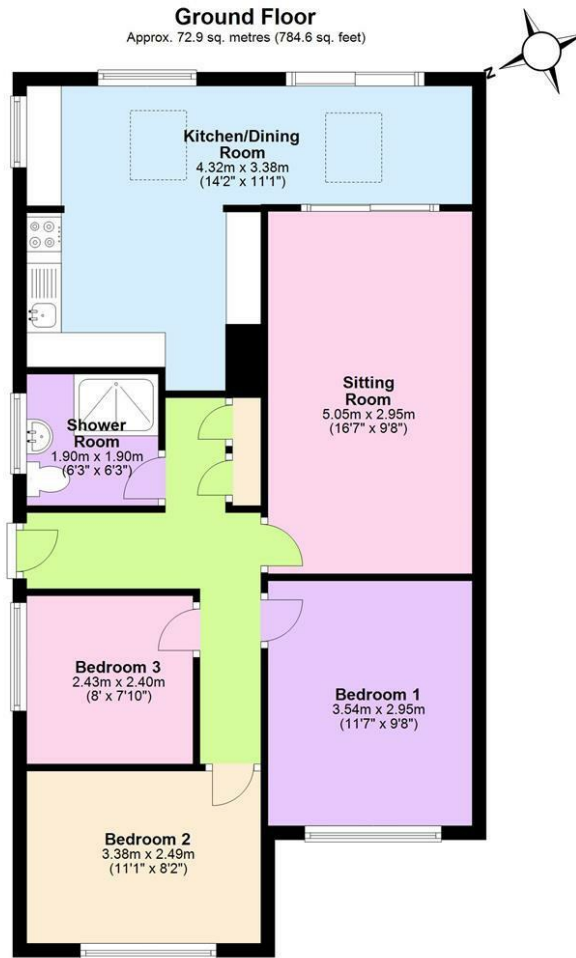
Total area: approx. 72.9 sq. metres (784.6 sq. feet) 279 Fortfield Rd, Bristol