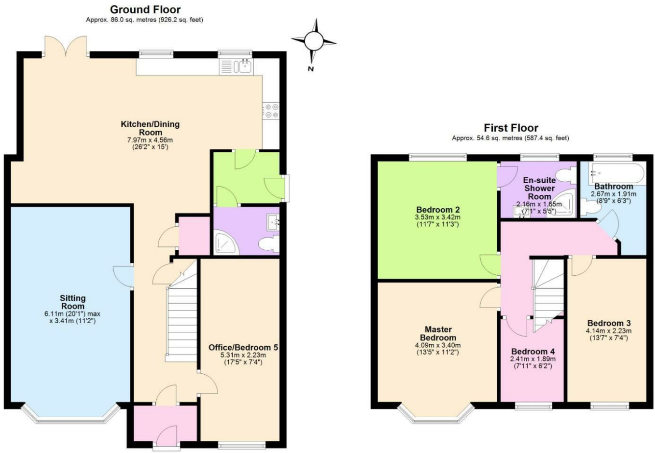
Total area: approx. 140.6 sq. metres (1513.6 sq. feet) 13 Orwell Drive, Keynsham