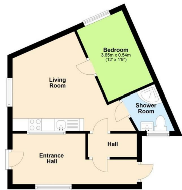
Total area: approx. 32.2 sq. metres (346.2 sq. feet)

Whilst every attempt has been made to ensure the accuracy of the floor plan contained here, measurements of doors, windows, rooms and any other items are approximate and no responsibility is taken for any error, omission, or mis-statement. The plan is for illustrative purposes only and should be used as such by any prospective purchaser. The services, systems and applicants have not been tested no guarantee as to their operability or efficiency can be given. Plan produced using PlanUp.