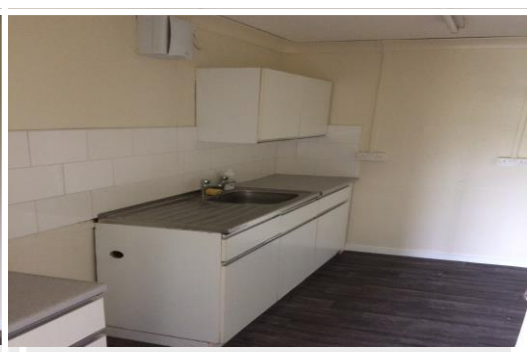
9 Rothesay Court | Westlands | Newcastle | ST5 2LX