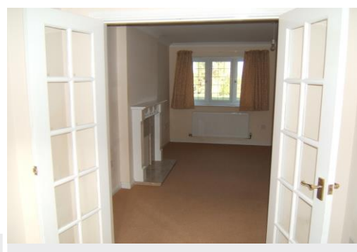
4 Lister Grove, Blythe Bridge, Stoke On Trent. ST11 9TS