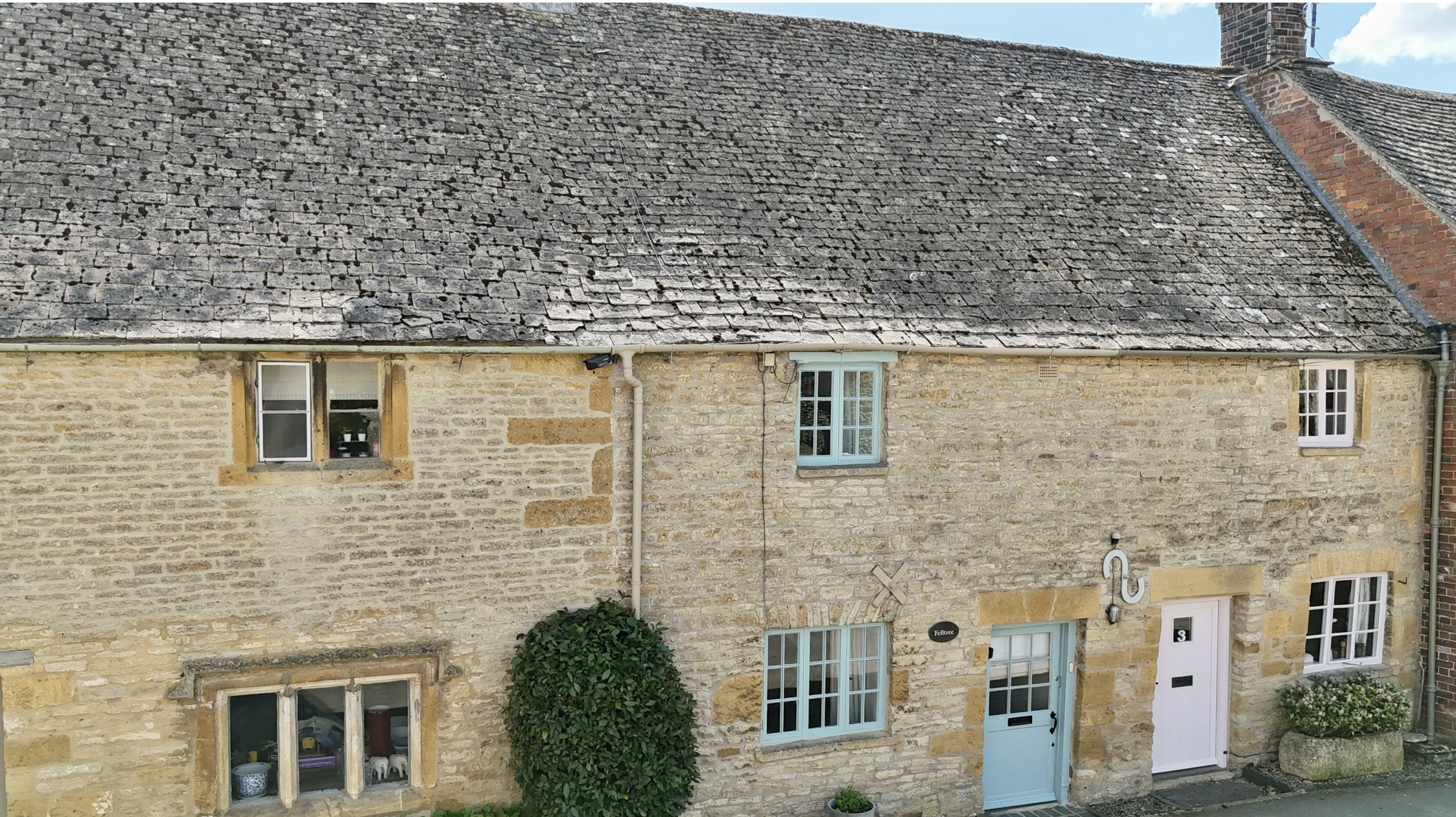
Felltree Cottage, Chapel Street , Broadwell, GL56 0TW Guide Price £399,950