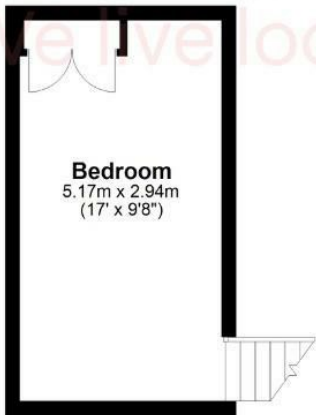
First Floor Approx. 15.2 sq. metres (163.7 sq. feet)

Total area: approx. 34.3 sq. metres (368.9 sq. feet)