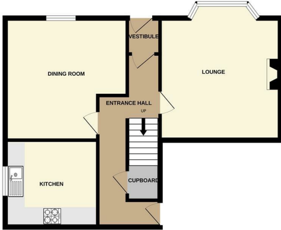
GROUND FLOOR 597 sq.ft. (55.4 sq.m.) approx.