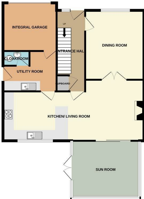
GROUND FLOOR 980 sq.ft. (91.0 sq.m.) approx.