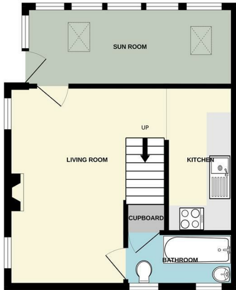
1ST FLOOR 295 sq.ft. (27.4 sq.m.) approx.