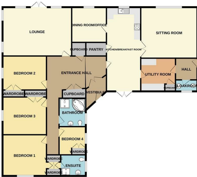
GROUND FLOOR 2223 sq. ft. (206.5 sq.m.) approx.