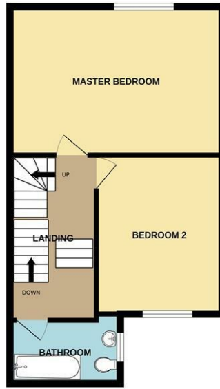
1ST FLOOR 462 sq.ft. (42.9 sq.m.) approx.