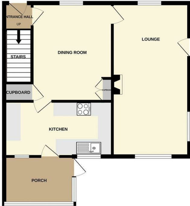
GROUND FLOOR 617 sq.ft. (57.3 sq.m.) approx.