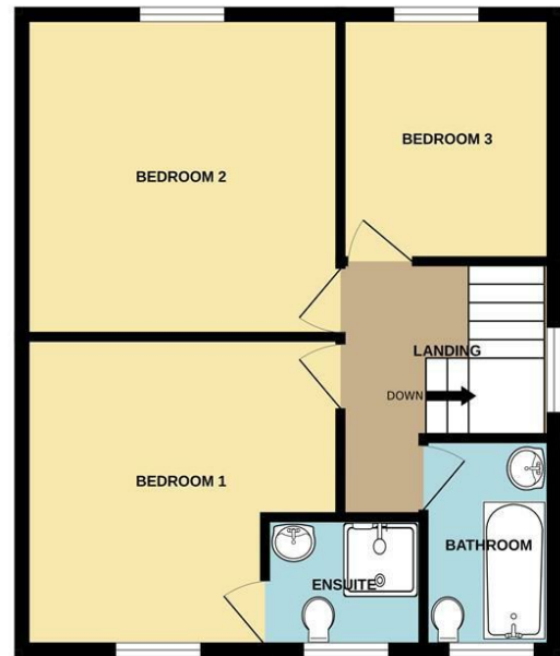
1ST FLOOR 515 sq.ft. (47.9 sq.m.) approx.