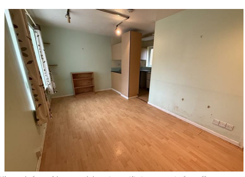
These particulars, whilst believed to be accurate are set out as a general outline only for guidance and do not constitute any part of an offer or contract. Intending purchasers should not rely on them as statements of representation of fact, but must satisfy themselves by inspection or otherwise as to their accuracy. No person in this firms employment has the authority to make or give any representation or warranty in respect of the property.