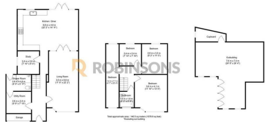
Illustration produced by Robinsons Photography Floorplan is for illustration purposes only and all measurements are approximate